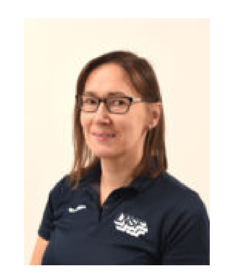
Head of OC